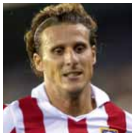
DIEGO FORLAN Football

When Diego Forlan curled that free kick past the Ghanaian goalkeeper in World Cup 2010, a star was born. Five goals in South Africa this year saw him receiving the Golden Ball as the best player. Speak to contemporary footballers and coaches and the consistent comment about Forlan's success is it is well-deserved, few footballers have such a rigorous work ethic. Speak to Forlan and he laughs it off saying he loves being on the field so much it translates into a lot of training!