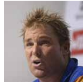
SHANE WARNE Retiring Cricket Victoria shirt

‘I hope you like this shirt, mate. It means a lot to me.’ These are Shane’s words in a letter that accompanied his autographed retiring Cricket Victoria shirt which he gifted to me. For me to donate this to my foundation is the most natural thing in the world. I did let Shane know what I was doing. He thoroughly approved. Good on him.”