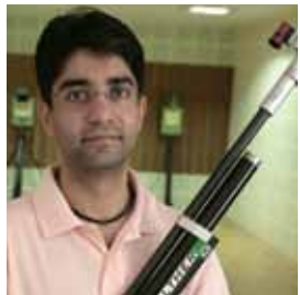
ABHINAV BINDRA Rifle - World Championship, 2006 World & Olympic record

“I have been very attached to this rifle of mine because it is with this rifle I made my breakthrough at the highest level. It’s also a system which had several technological advancements done specifically for me including a handmade calibrated trigger mechanism. I won approximately 25 international medals during the 6 years I shot with this system. I must admit it is a little wrenching to give this away, but also extremely satisfying. This country needs organizations like The Foundation. My best wishes are with them.”